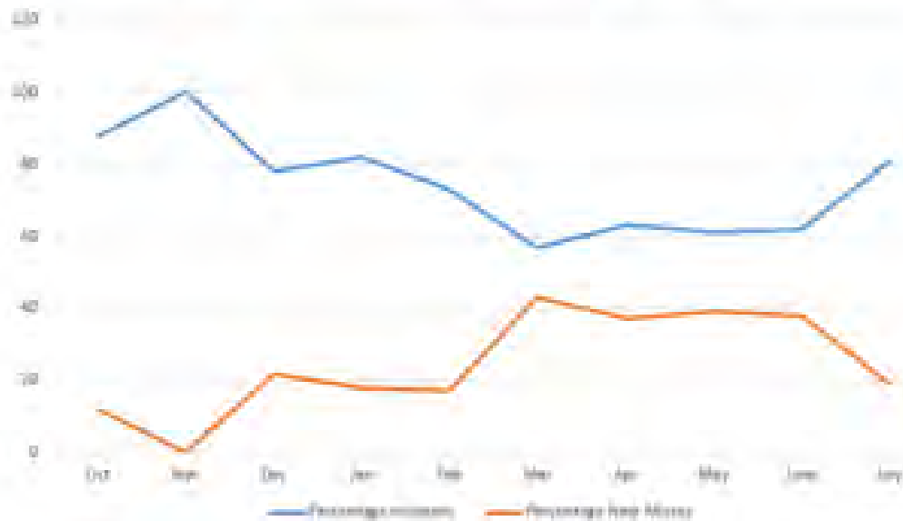
Percentage of Medication Administration RIMS Reports Classified as Incidents vs Near Misses