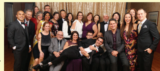
PRH doctors taking part in the celebration.

More than 225 local health care champions took part in the lavish night, filled with excellent food, dance and entertainment – all to fuel exceptional health care at the Pembroke Regional Hospital. The event's success broke Gala records, netting over $140,000.